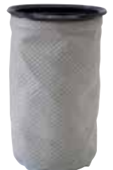
Cloth Bag: Part # 122-3229-14