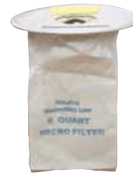
Disposable Paper Bag: Part # 122-3226-14

The HEPA Pro 6EB is equipped with a "Fail-Safe" HEPA filter system that protects against discharge or bypass of dangerous dust particles from the vacuum cleaner. This modular, drop-in and removable HEPA filter, cloth pre-filter and disposable paper bag, all seal together tightly under suction. There is zero risk of the operator incorrectly installing the HEPA filter and accidentally causing bypass, thus contaminating the air with dangerous particles. Also, in the event of a failure, by rupture or the like, of the cloth filter bag or disposable paper bag, the HEPA filter is the final filter and certified to trap any particles before they can be released into the air.