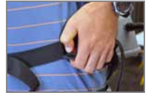
On-Off Switch: Hip mounted for easy access.