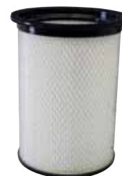
HEPA Filter: Part # 127-3320-14